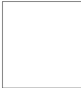
LEFT THUMB IMPRESSION (within Box)