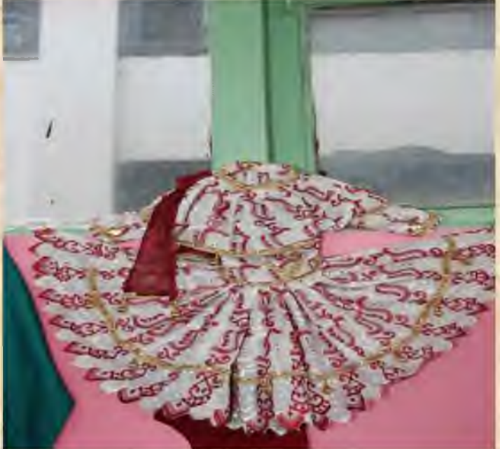
Baby Frock Churidaar prepared by the learners