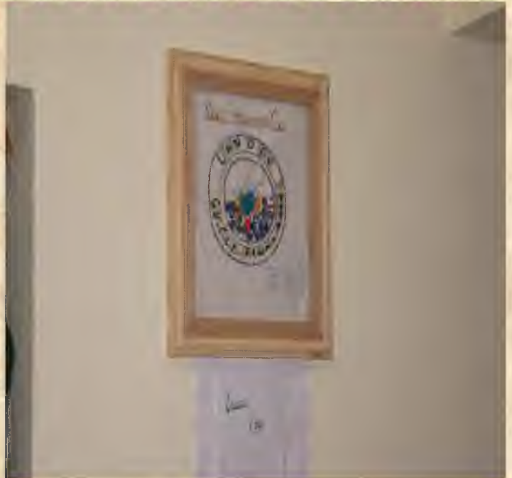
College Logo made of Moti (Pearl Work). Master Syed Iqra B.A 3rd year master of Moti (pearl work) preparing sample for college using creative combinations of pearls (moti) on cotton cloth