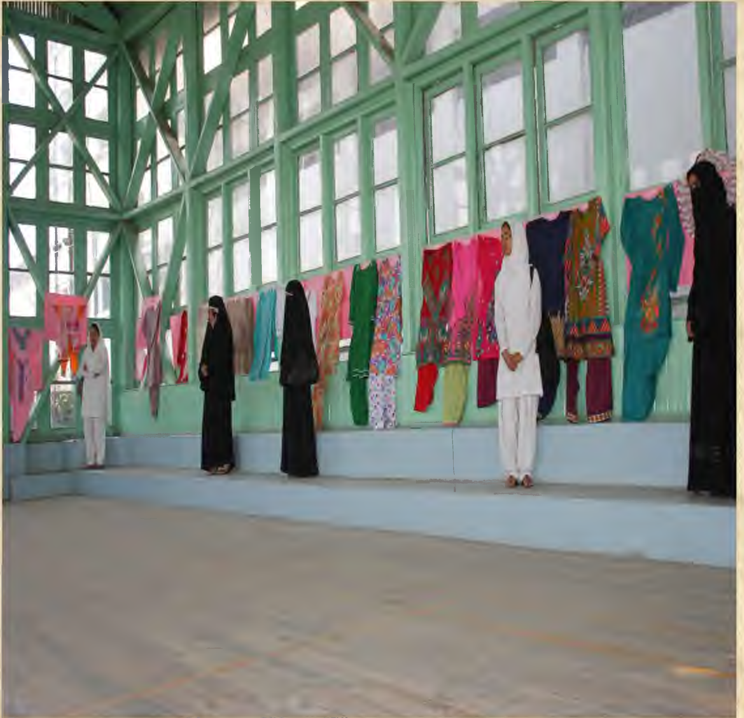
Display of Samples Designed by Student Learners